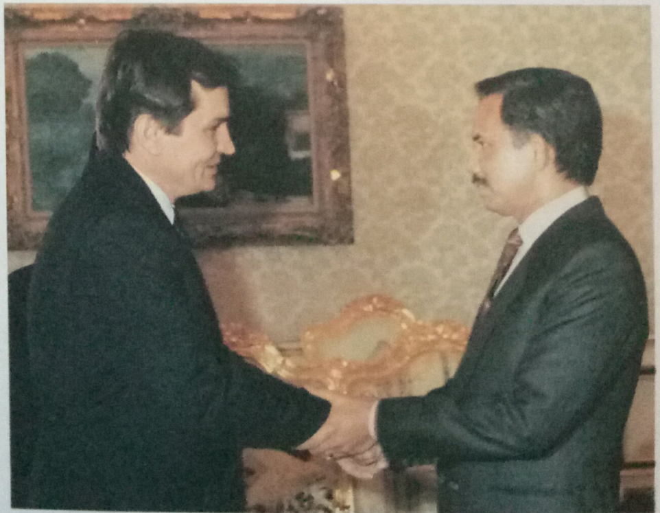
Exchange of warm greetings as the Bosnia-Herzegovina Foreign Affairs Minister, His Excellency Mr. Harris Siladjic arrives at Istana Nurul Iman for an audience with His Majesty Paduka Seri Baginda Sultan Haji Hassanal Bolkiah Mu'izzaddin Waddaulah, Sultan and Yang Di-Pertuan of Brunei Darussalam on 18 August.