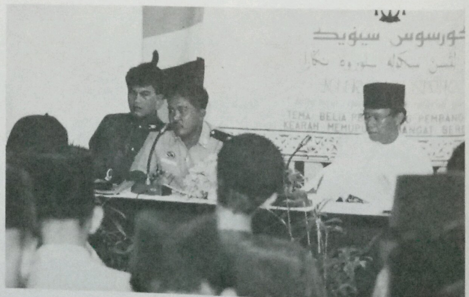
Talks given to the course participants included those by police personnel on youth-related crimes and careers in the police force.